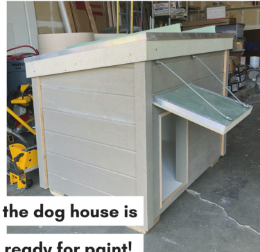
the dog house is ready for paint!